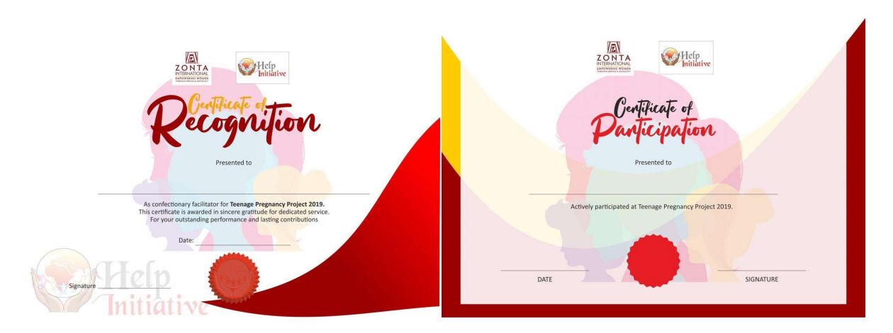
Certificate for the Facilitators and Beneficiaries