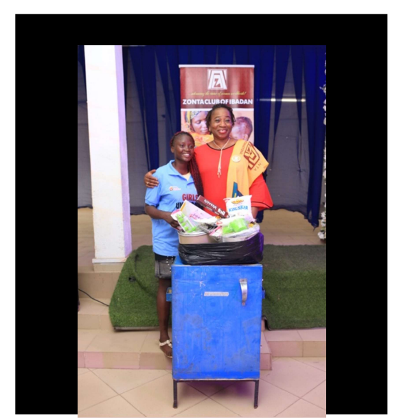
Hair Making Beneficiaries was empowered with