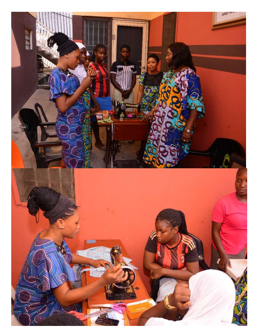
Dress Making Training Section