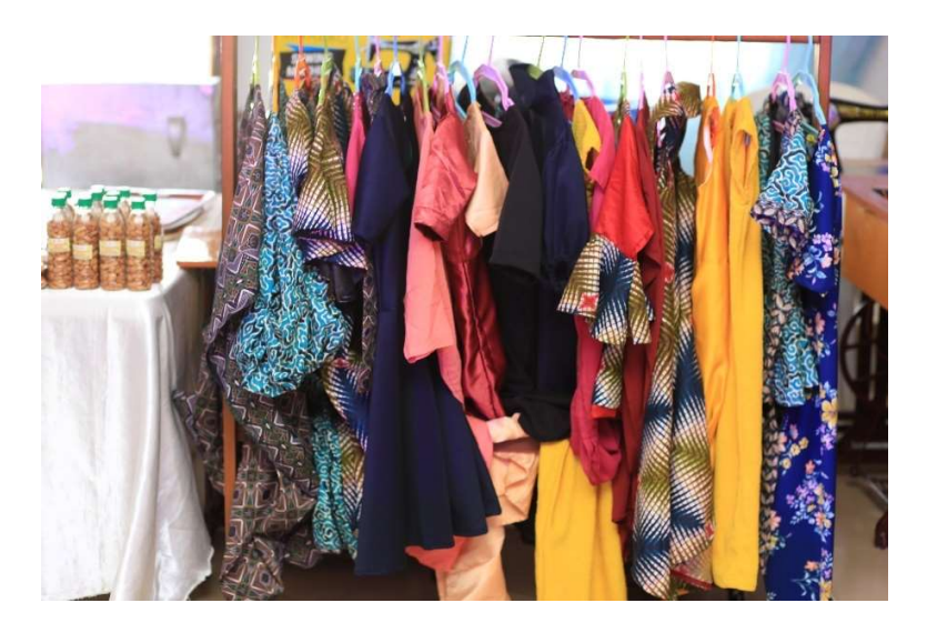
DRESS MAKING GROUP