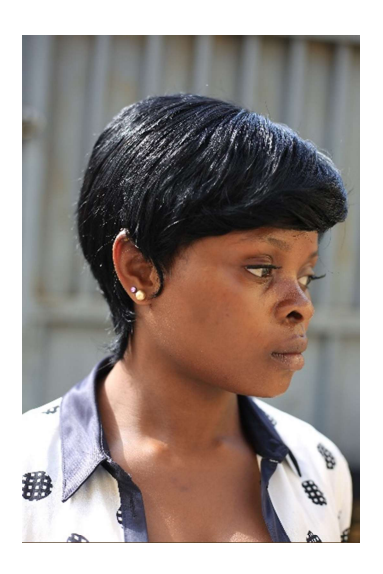
Hair Making Training Section