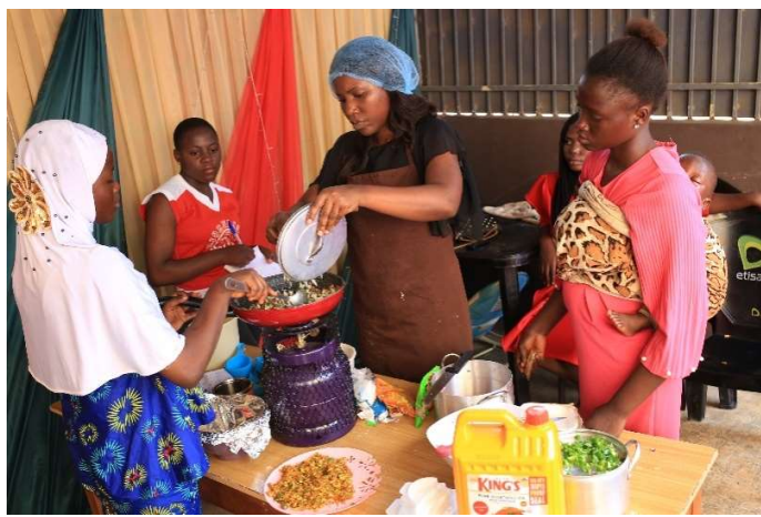
Confectionary Training Section