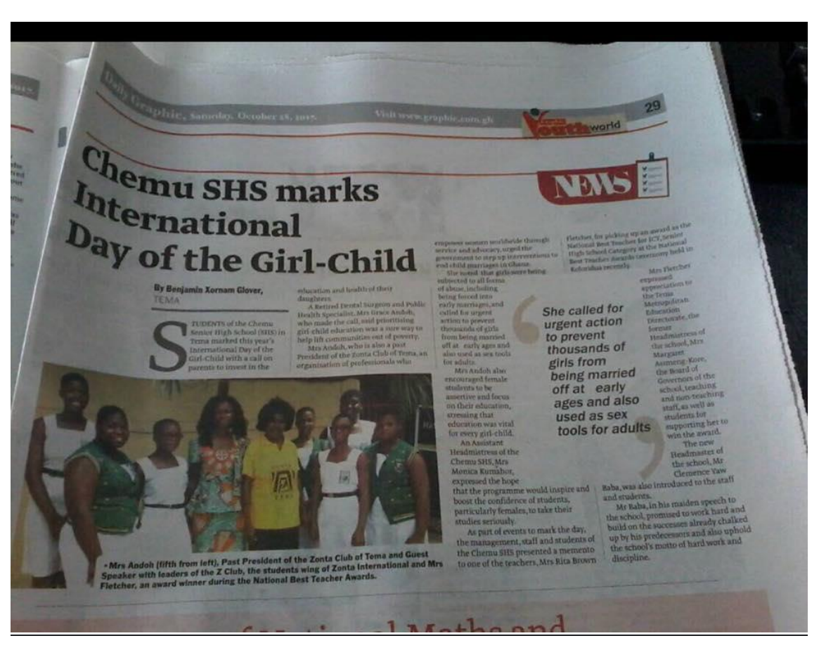
Zonta Club of Tema spends the International Day of the Girl Child with female students at Chemu Senior High School, providing them mentorship.