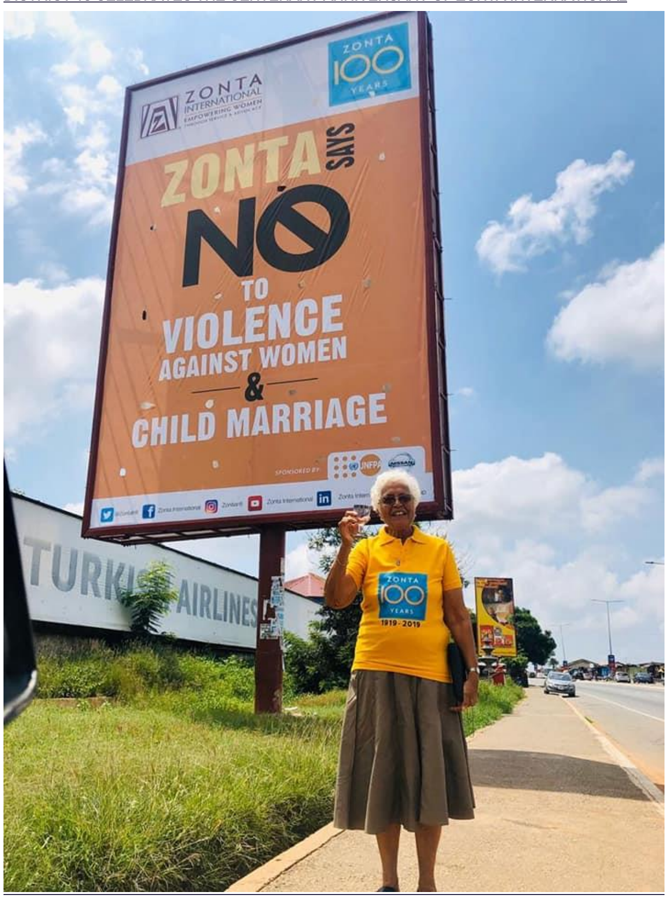
A massive Billboard mounted by the Zonta Clubs in Ghana in conjunction with the UNFPA