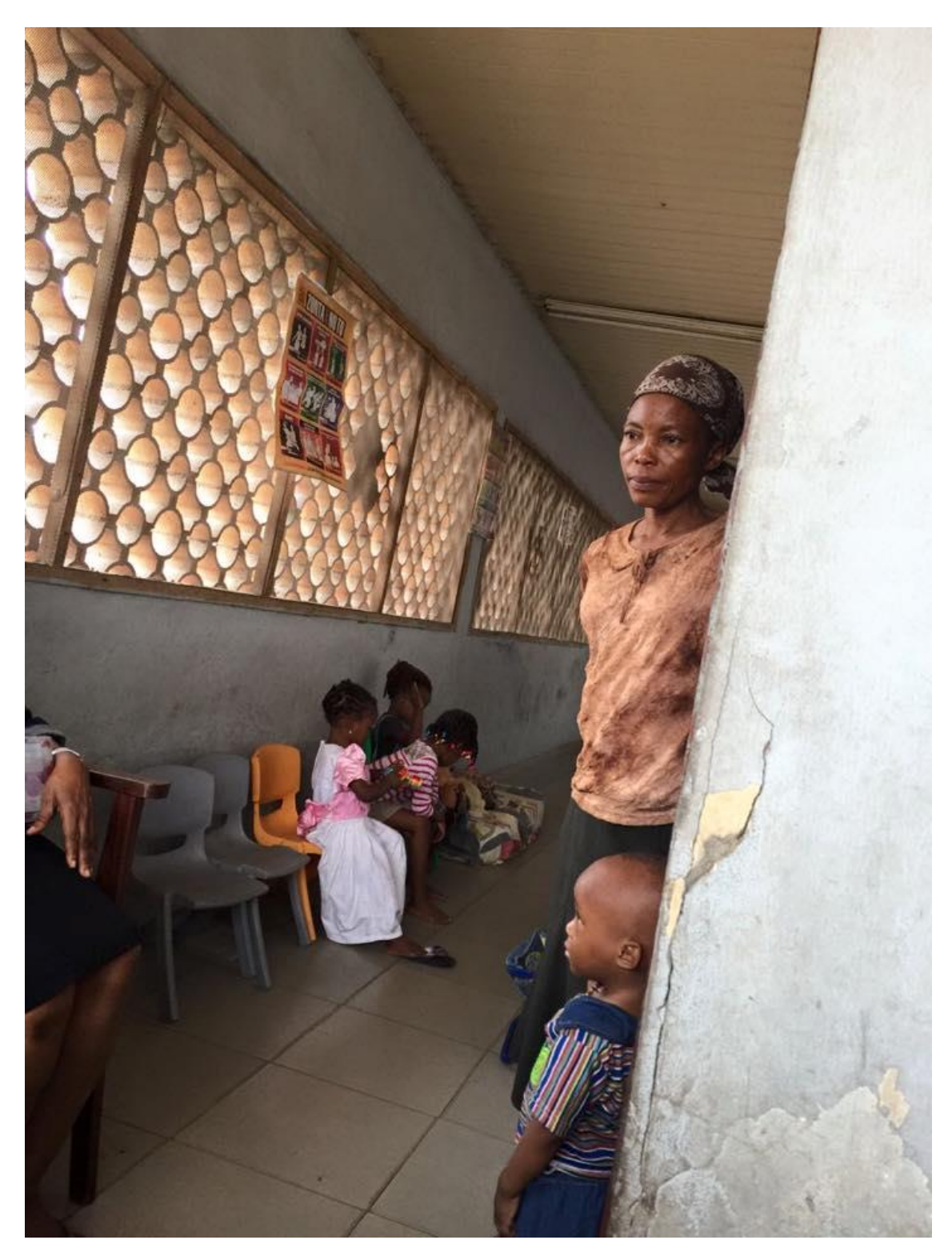
Local service project of Lagos 1 - A crèche for infants and children of market women who can be assured of a safe haven for their little ones whilst they sell in the market. One of two of the Crèche attendants with some of the children.