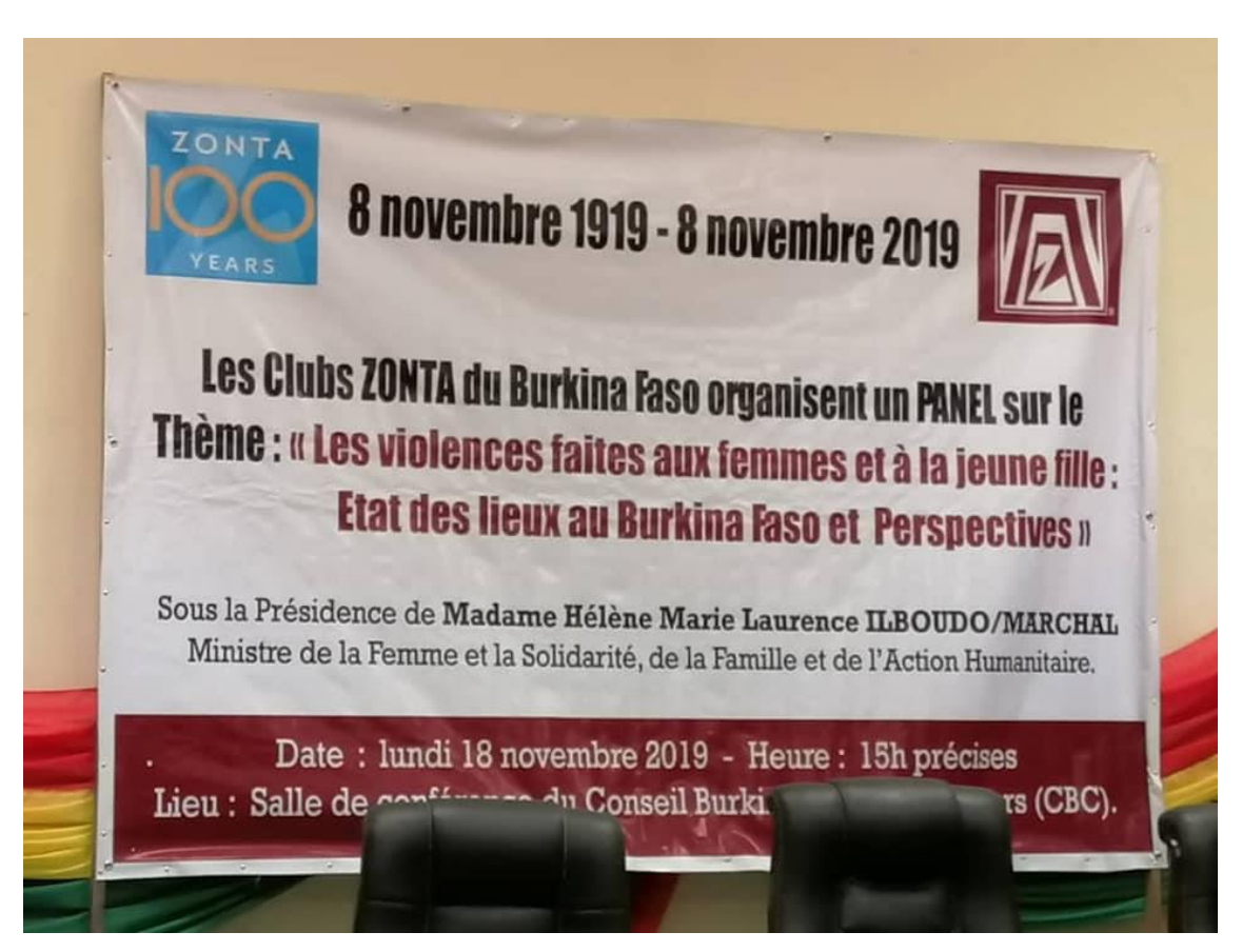
Zonta Clubs in Burkina Faso held a Seminar on the Topic of Violence against Women and the Girl Child under the auspices of the Minister of Women National Solidarity, and Family