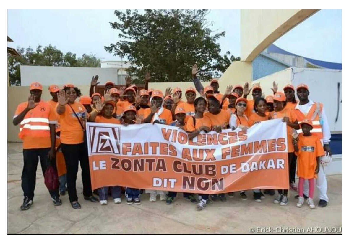
Zonta Club of Dakar Advocacy Walk - 16 Days of Activism