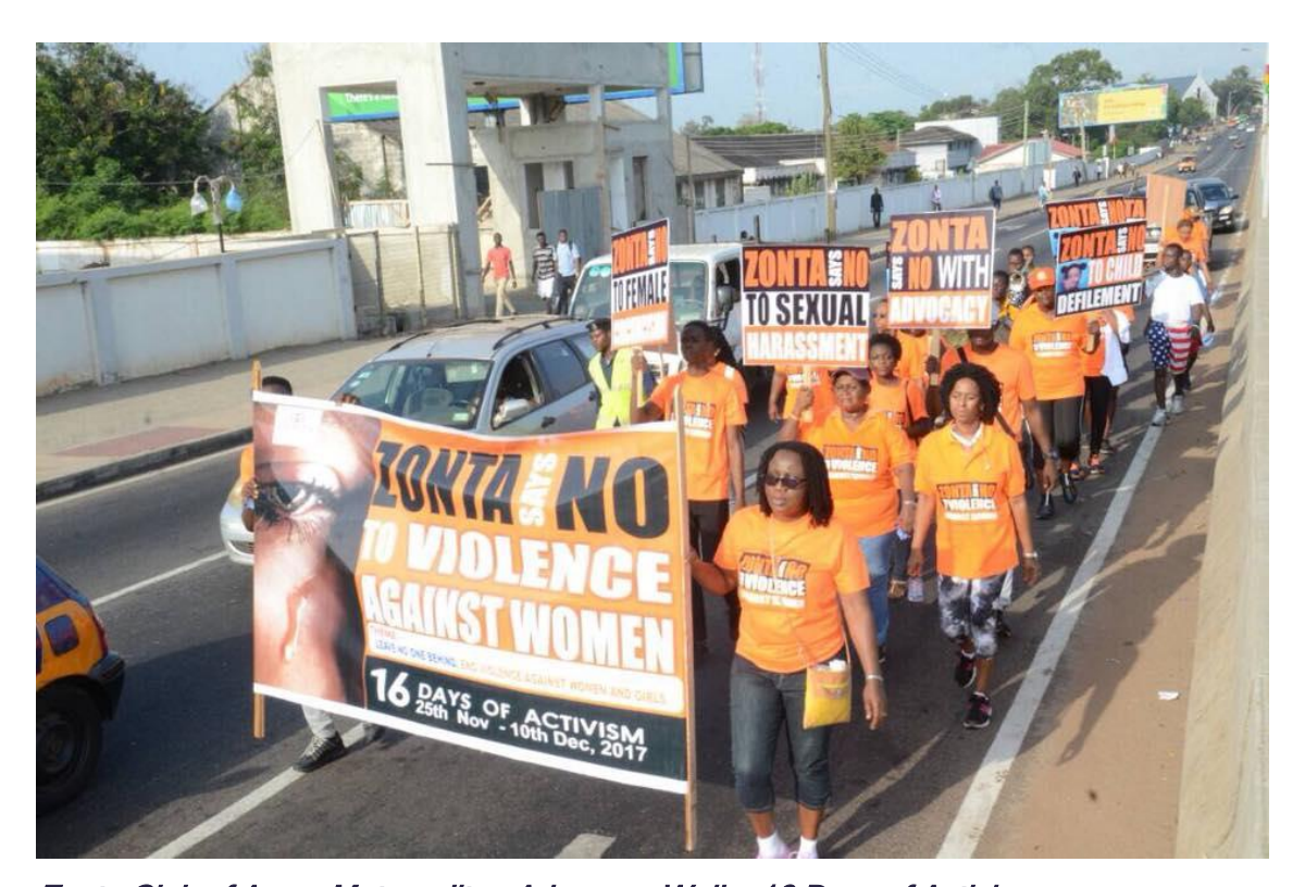
Zonta Club of Accra Metropolitan Advocacy Walk - 16 Days of Activism