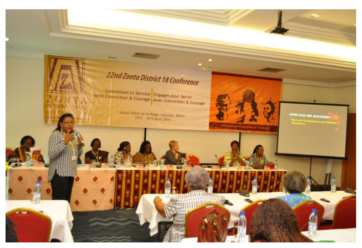
22<sup>nd</sup> Zonta District 18 Conference held in Benin in 2015