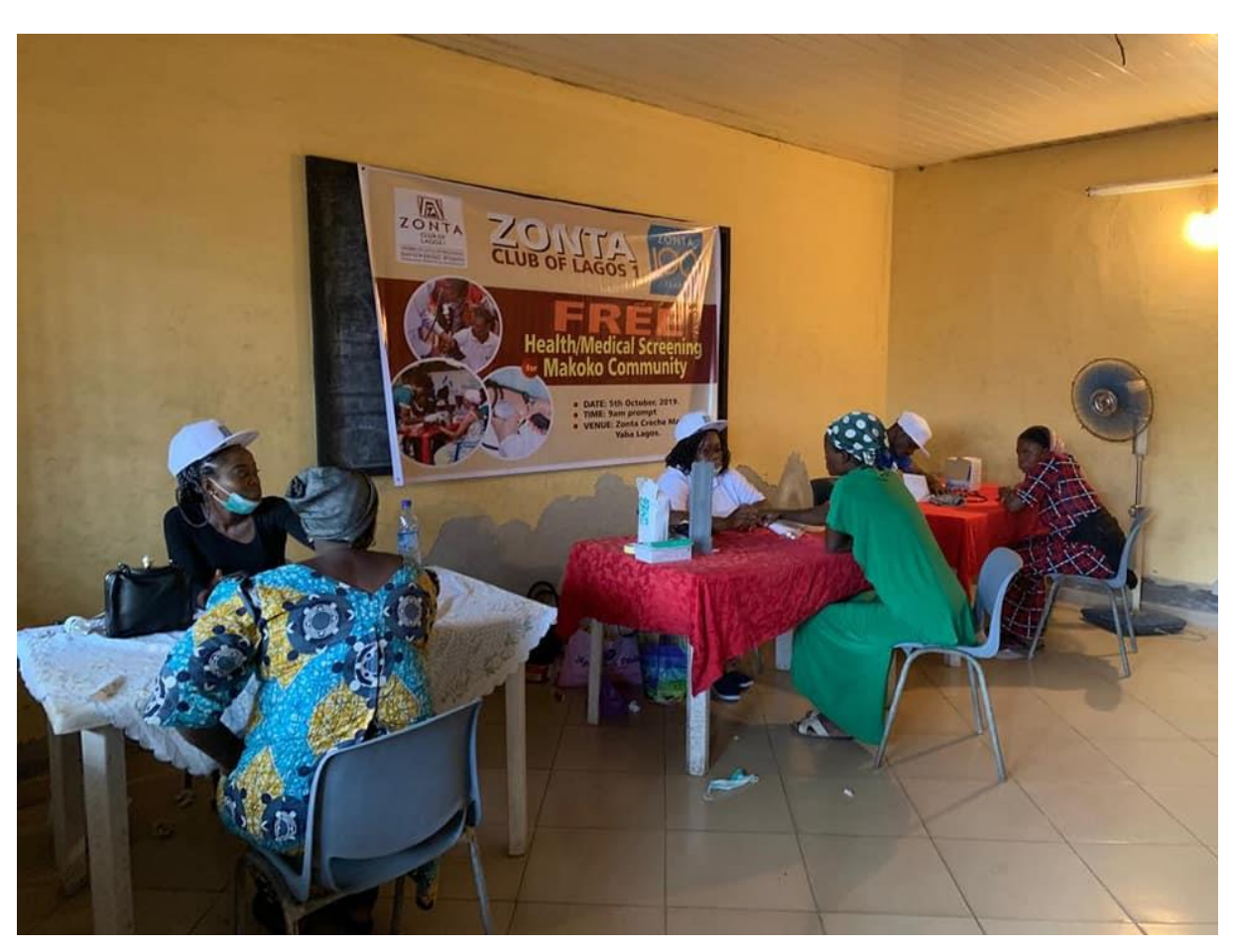
Zonta Club of Lagos 1 providing Free Health Screening exercise for residents in the Makoko Community.