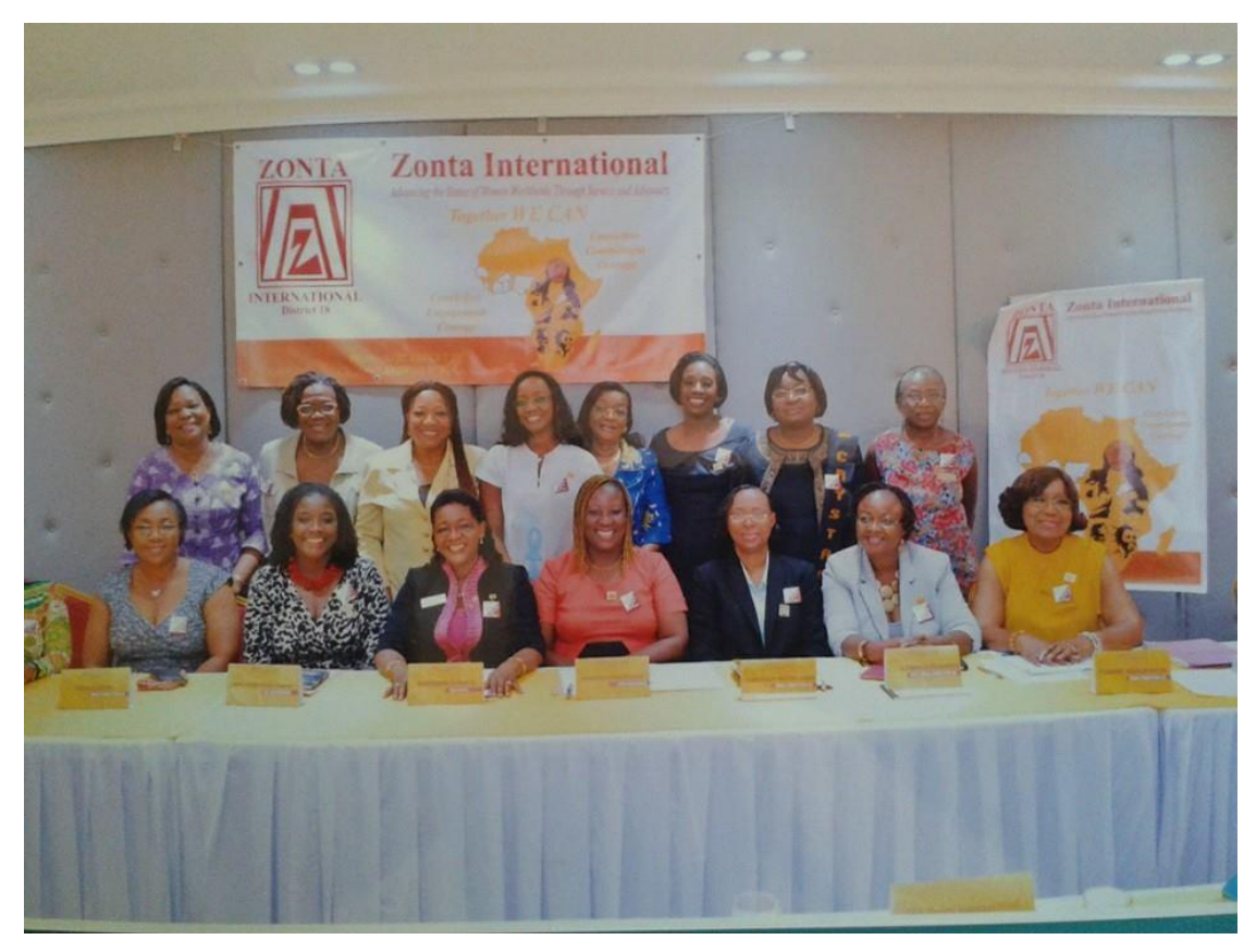
District 18 Board and Committee Chairperson at a Board meeting in 2014