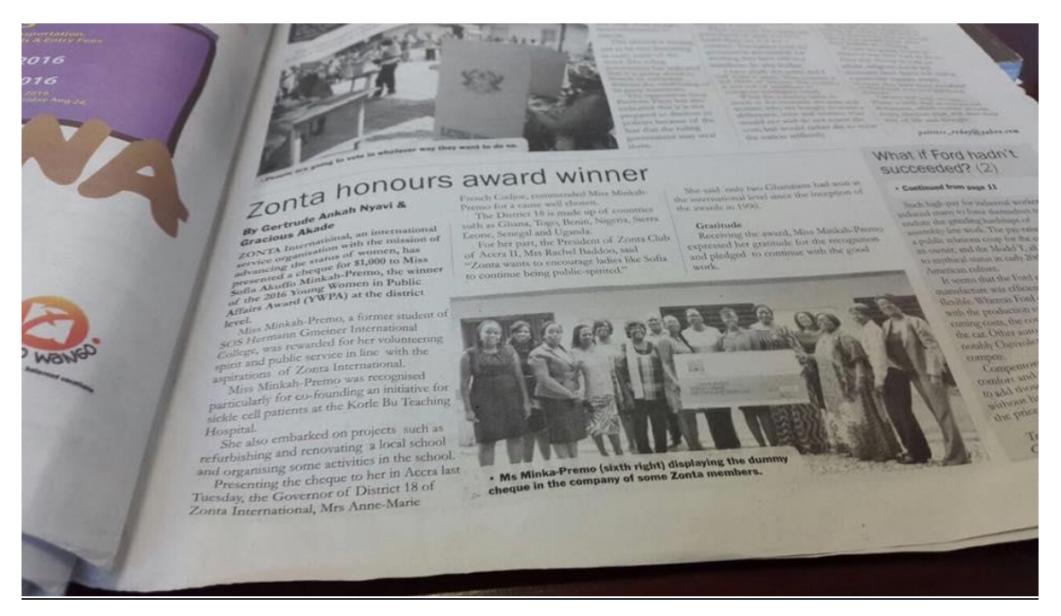
Zonta Club of Accra II presents award to the YWPA Award recipient for District 18.