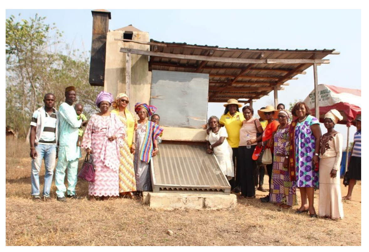
Zonta Club of Ibadan 1, Donates Solar Biomass Hybrid Dryer system to Akufo Farms in Ibadan to enhance activities of the predominantly female farming community. 2017