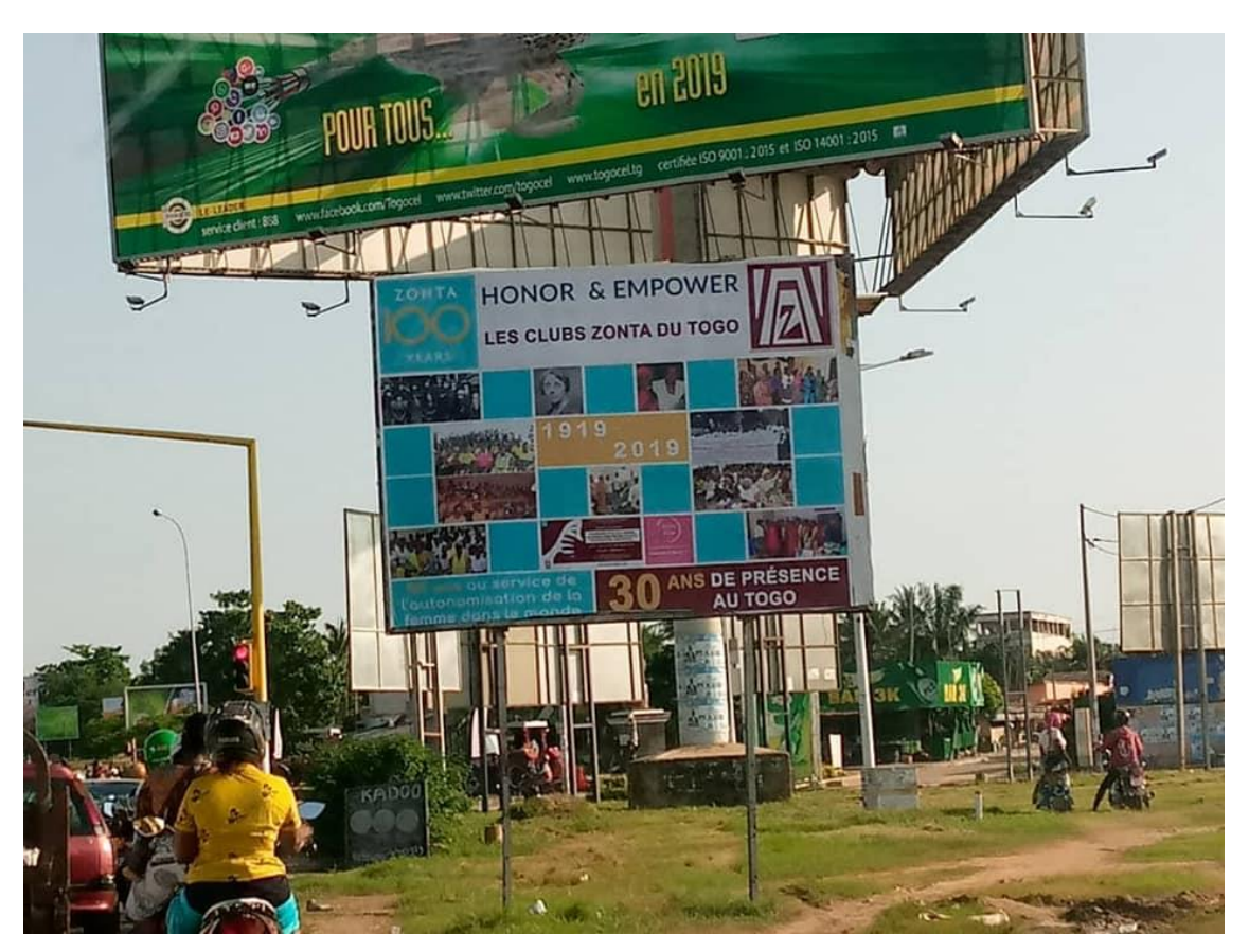
Zonta Clubs in Togo mount a Massive Billboard in celebration of Zonta at 100