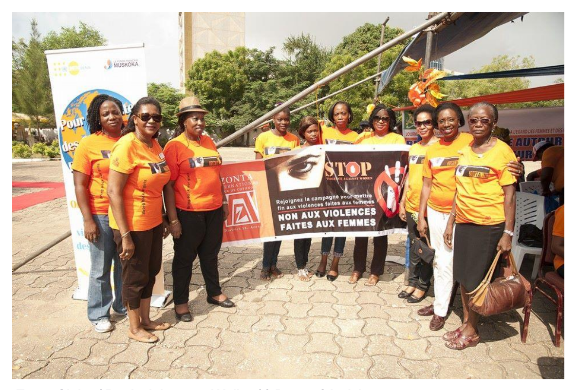
Zonta Club of Benin Advocacy Walk - 16 Days of Activism