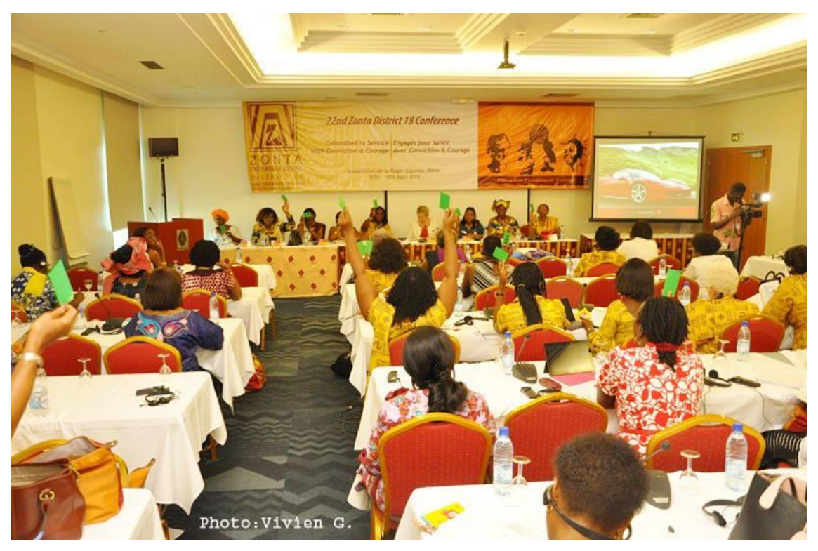
22<sup>nd</sup> Zonta District 18 Conference held in Benin in 2015 - Delegates Casting their Votes