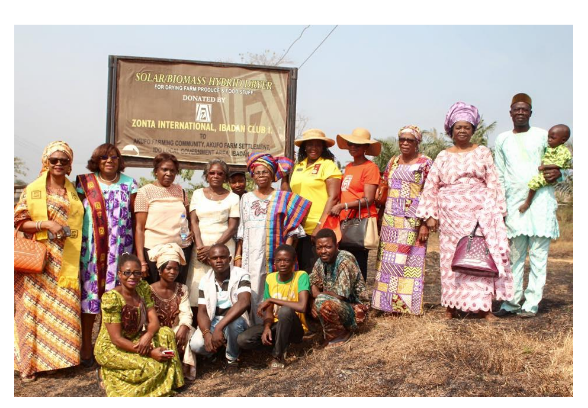
Zonta Club of Ibadan 1, Donates Solar Biomass Hybrid Dryer system to Akufo Farms in Ibadan to enhance activities of the predominantly female farming community. 2017