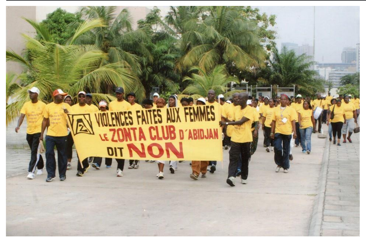
Zonta Club of Abidjan Advocacy Walk - 16 Days of Activism